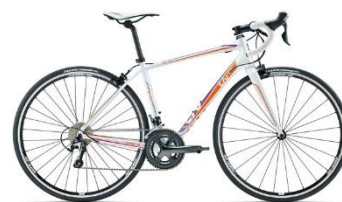
Aluminium Road Bike

A helmet will be provided if you do not have yours.