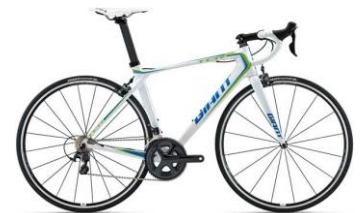
Carbon Road Bike